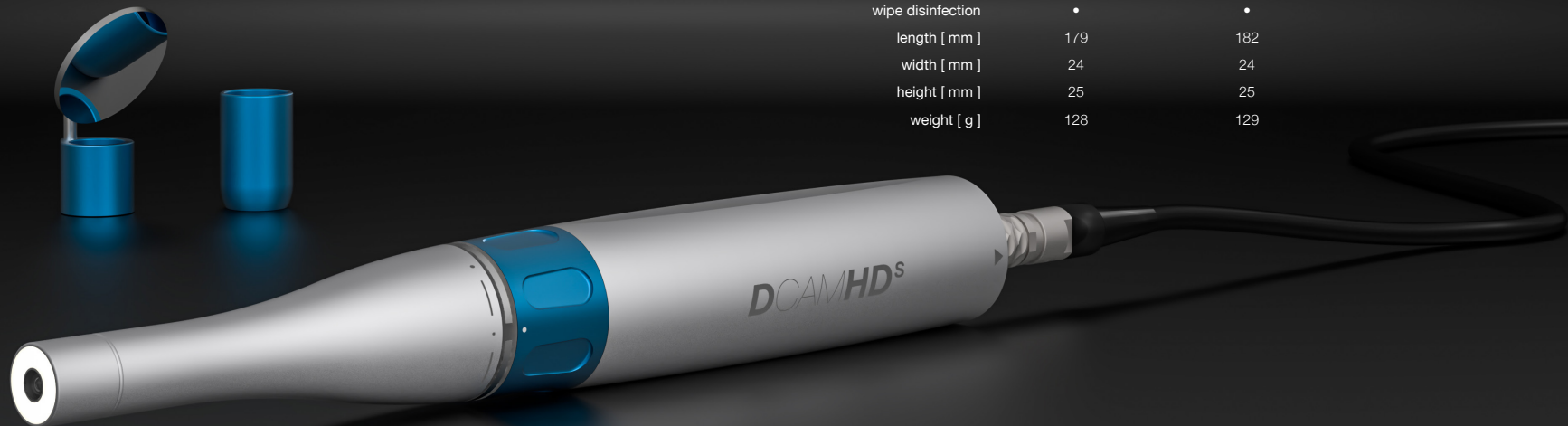
D-CAM HD S 0° D-CAM HD S 90°